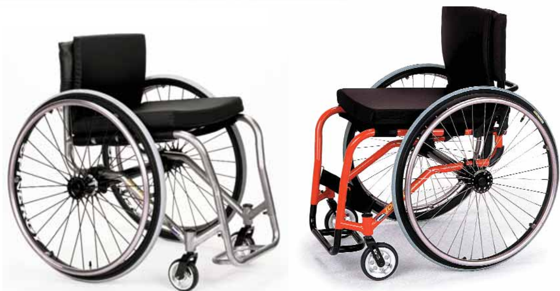
Invacare® Top End® Terminator™ Titanium shown with optional Spinerge® rear wheels.

The Invacare® Top End® Terminator™ Titanium and Terminator™ Everyday are full frame designed chairs and are perfect for extremely active or rugged lifestyles. If you want a super customized chair without all the custom upcharges or if you want the option of rear suspension, these are the chairs for you. The new ergonomic seat option is something you definitely want to check out. For more details see page 3, as all of the same great benefits also apply to the Terminator. If you need a heavy-duty option you won't have to sacrifice either - the Terminator Series combines great design with the strongest and lightest materials to give you a super chair that fits perfectly and delivers everyday performance. Built for you - exactly the way you want it.